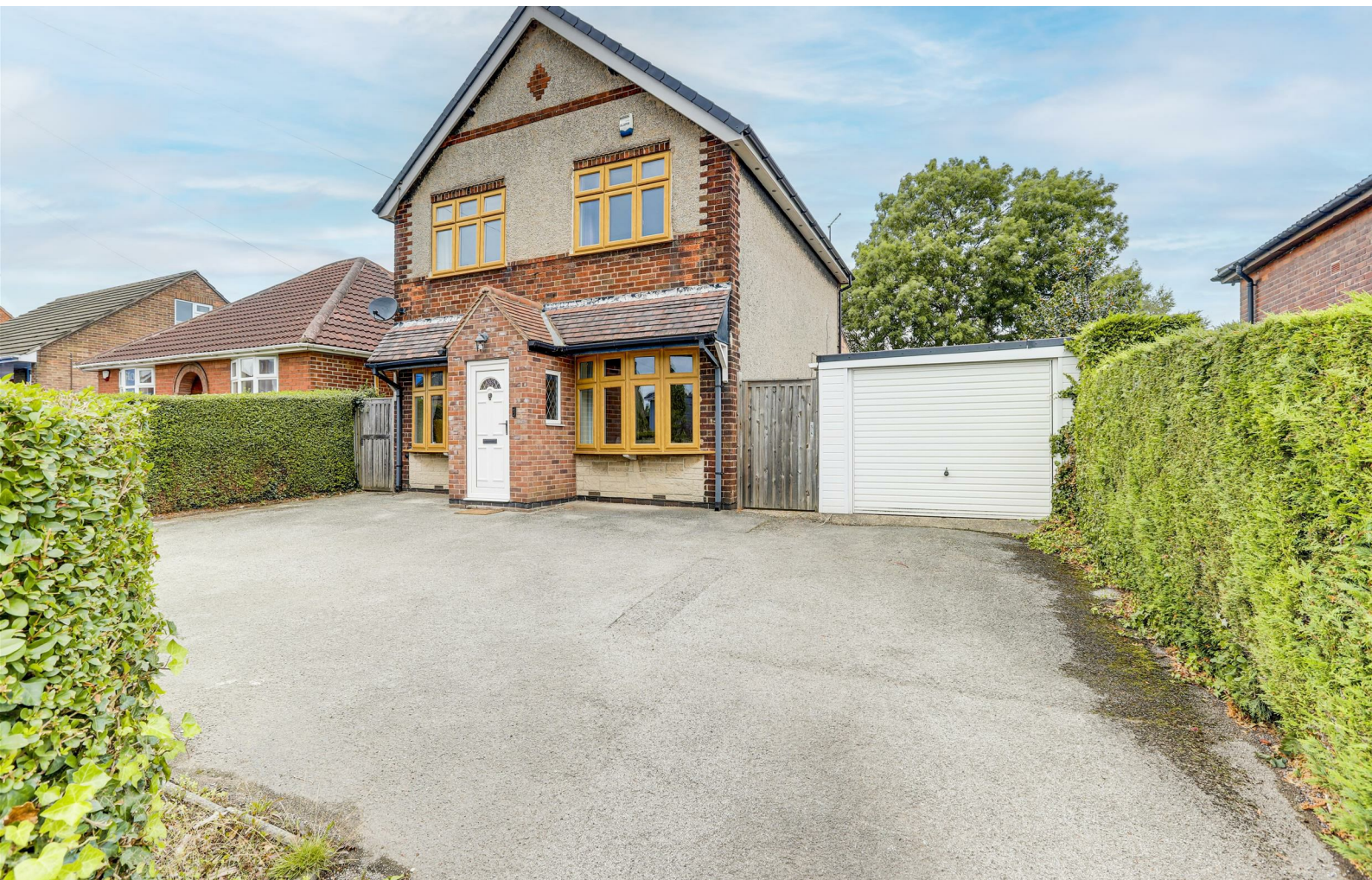
Forest Road, Kirkby-In-Ashfield, Nottinghamshire NG17 9HD